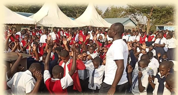
Students from Ken-Obura Mixed Secondary School during a worship session