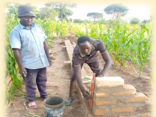
Church planting in Tabora Diocese- Tanzania

A newly planted church was constructed on 28 th February 2023 at Izumba village- Tabora Diocese. Indeed, we thank God for the great work in Tabora