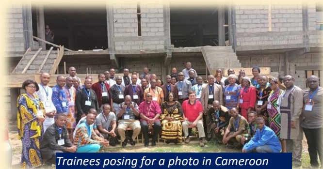
Trainees posing for a photo in Cameroon

Anglican Missions Africa visited the Anglican Diocese of Cameroon on 25 th March - 1 st April 2023. We successfully trained 65 clergies and lay people therefore equipping them for church planting movement. Each of them will train 15 more people for church multiplication, thus contributing to the growth of churches in Africa. In addition, AMA distributed a total of 5 tents to be used in church planting.