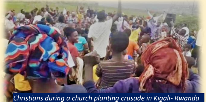
Christians during a church planting crusade in Kigali- Rwanda

Church planting movement took place in Rwanda on 6 th March 2023, after AMA healthy church training on 31 st January - 3 rd February 2023. The trainees have continued to engage in evangelistic campaigns a basis to plant more churches. Furthermore, AMA distributed a total of 6 tents for church planting.