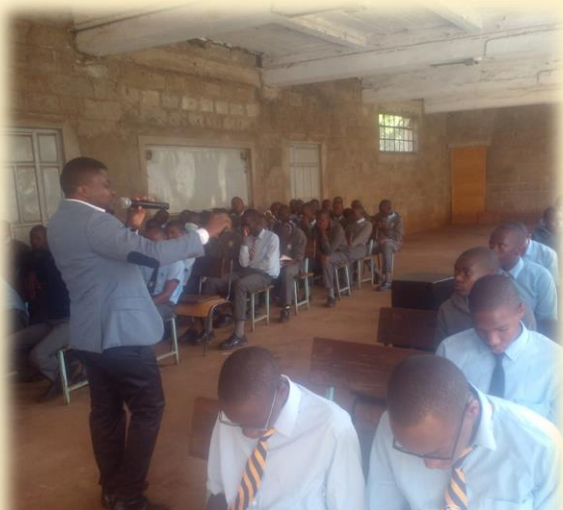
Students from Nairobi Milimani Sec school during a sermon

Summary; 6908 students reached with 1174 getting saved