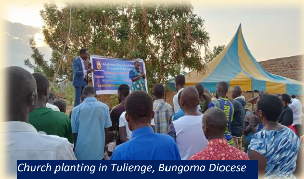
Church planting in Tulienge, Bungoma Diocese

We give glory to God for his revival in East Africa. A new church was planted on 26 th February 2023 at Tulienge, Bungoma Diocese, Kenya.