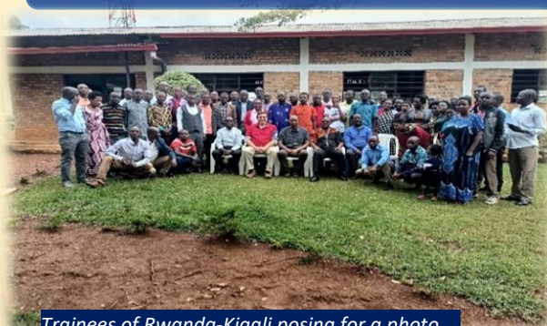
Trainees of Rwanda-Kigali posing for a photo