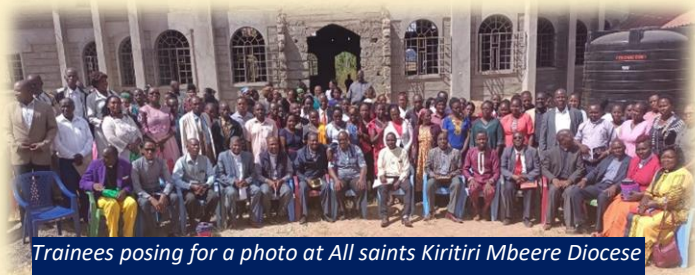
Trainees posing for a photo at All saints Kiritiri Mbeere Diocese