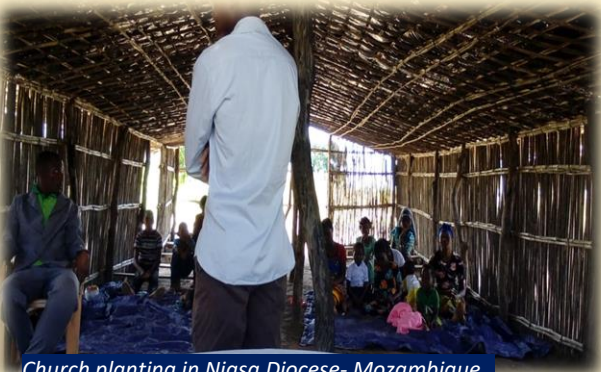
Church planting in Niasa Diocese- Mozambique

Mozambique has continued to shine light of church planting with recent church plants in Tete and Niasa Diocese in March 2023