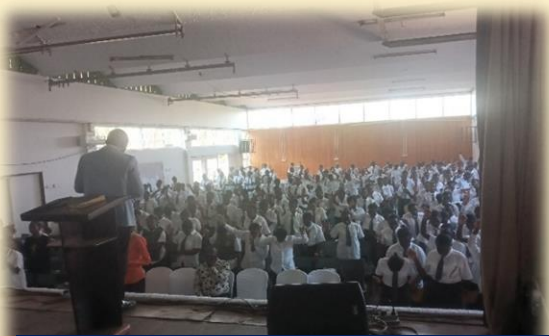
Students from State House during a prayer session.