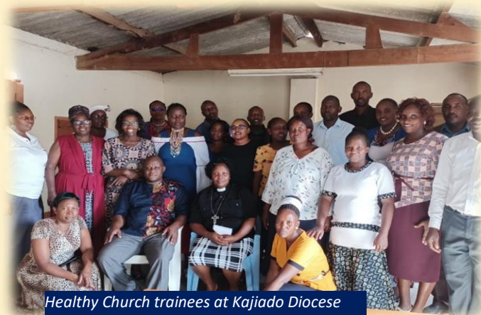
Healthy Church trainees at Kajiado Diocese

AMA has entered in partnership with Kajiado Diocese to undertake a comprehensive healthy church training for both Clergy and Laity. The first training being on 6 th – 10 th March 2023 with a total of 24 evangelists being successfully trained.