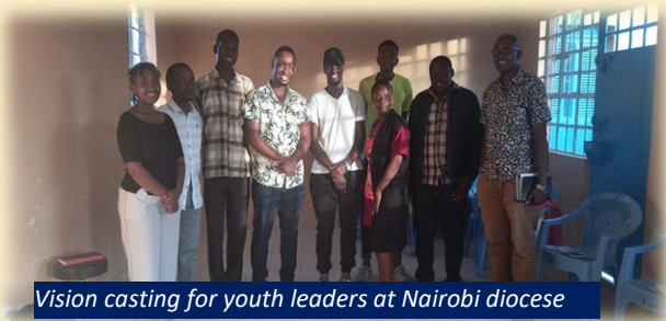
Vision casting for youth leaders at Nairobi diocese

As result of engagement, outreach has been realized as follows: