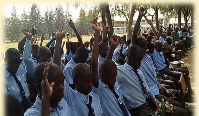
Students from Kisian Mixed School during a prayer session